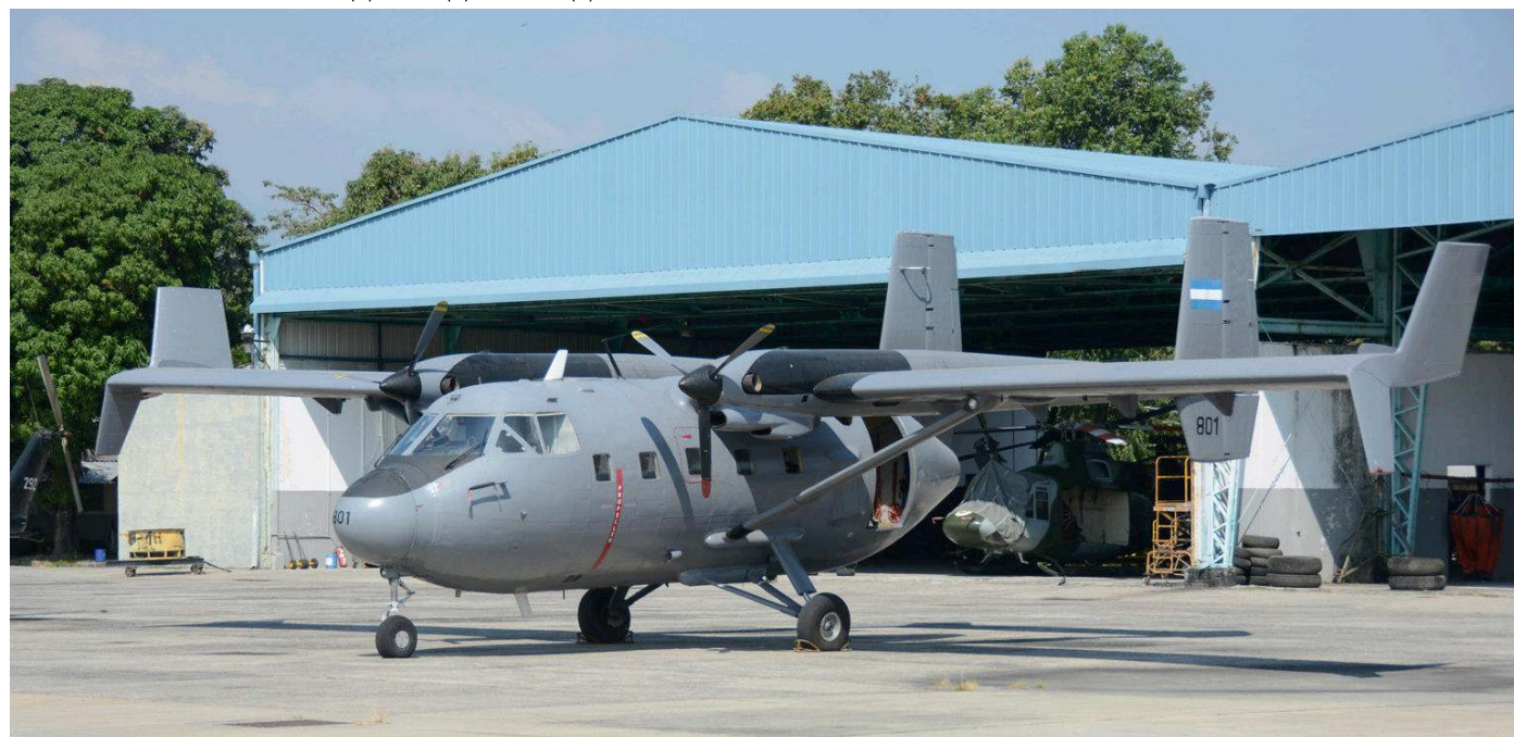
Always a great catch is an IAI Arava, especially when it is an operational one. IAI202 801 of the air force of San Salvador was caught on the Ilopango apron on 19 February 2019.