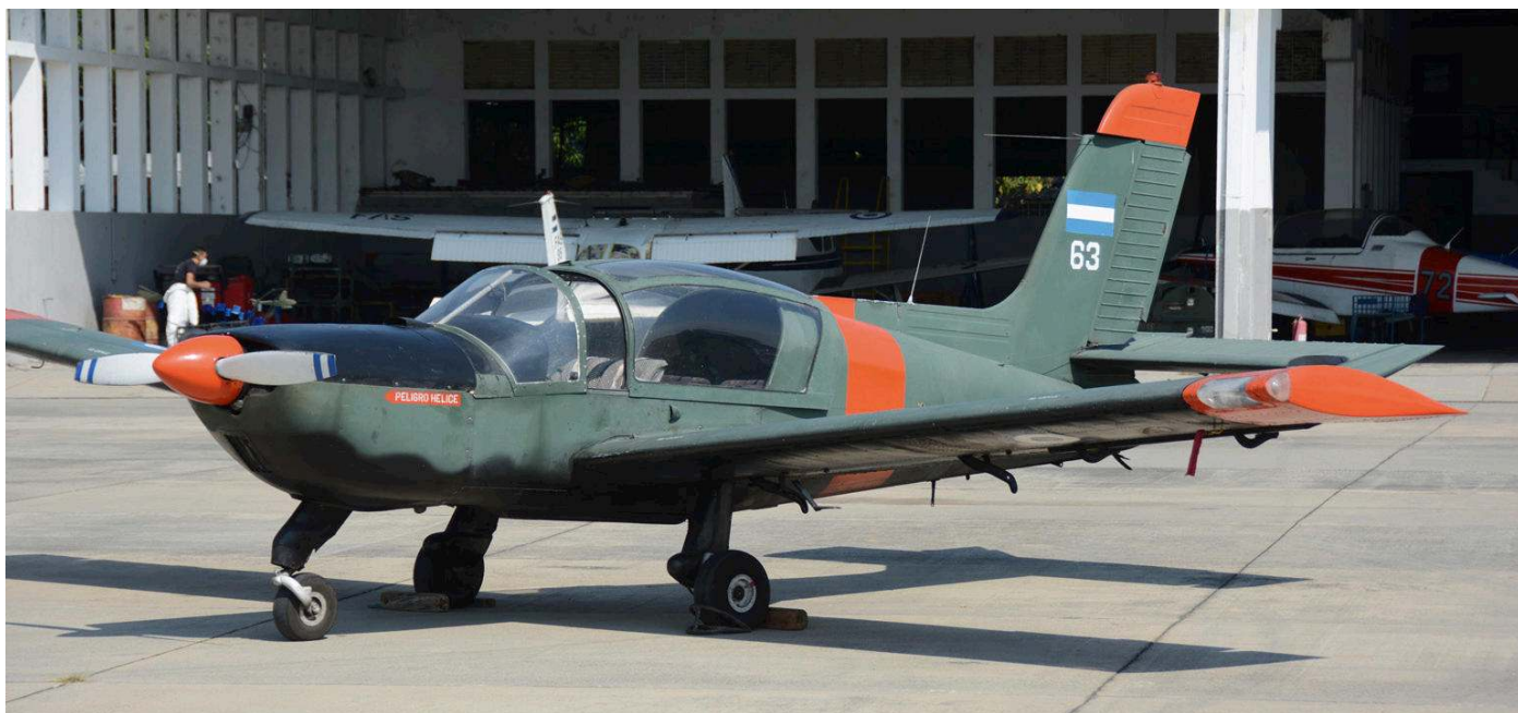
Withdrawn from use, but still a gem in the collection must be this MS893. The type was retired in 2010 but serial 63 looks like it has just been prepared for another flight. (Ilopango, 19 February 2019)