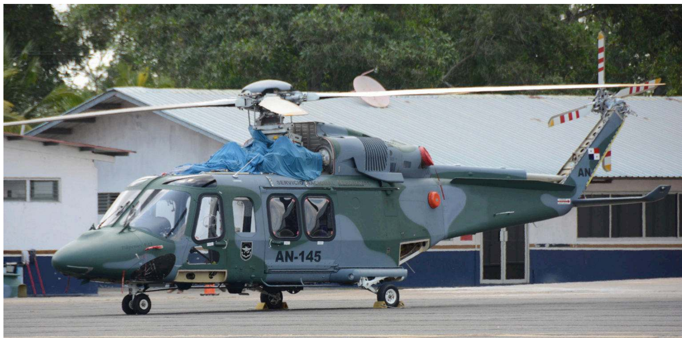
AW139M, serial AN-145, from Escuadron de Helicopteros was photographed at Panama City-Tocumen. (27 February 2019)

TG-BJO S.340A TAG Aviation TG-TRC ATR72-212A Avianca Guatemala TG-TRE ATR72-212A Avianca Guatemala