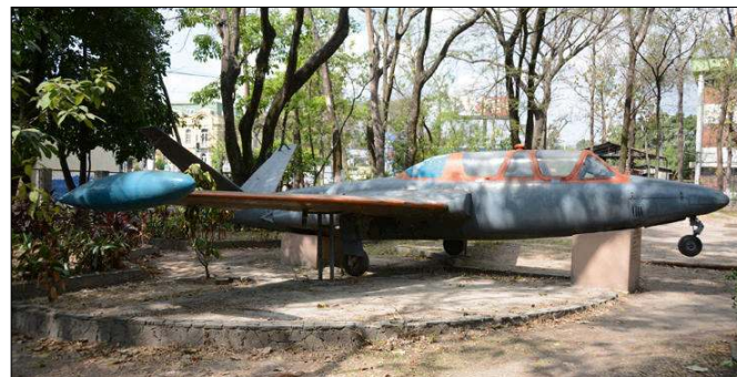
Magister serial 500 is an ex Israeli CM170. The aircraft is now preserved at San Salvador-Museo Nacional de Aviacion. (19 February 2019)

Avianca Central America A319 (2), A320 (1), ERJ190 (4)