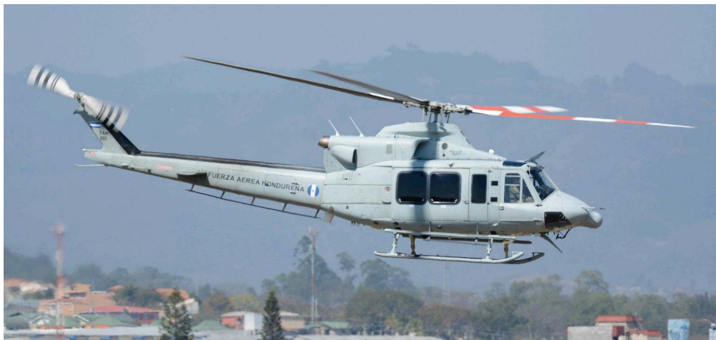
Bell 412SP 980 of Honduras' Hernan Acosta unit was among the much-wanted flying assets actually getting airborne in front of the cameras. The happy feat took place at Tegucigalpa-Toncontin on 21 February 2019.