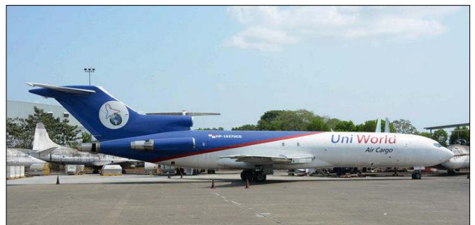
UniWorld Air Cargo is the operator of Boeing 727 HP-1937UCG since May 2017.