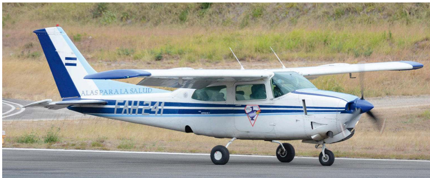
Cessna T210N, serial 241, with Alas Para Salud titles is one of the impounded aircraft with the Fuerza Aerea Hondurena. The aircraft has an 1 Grupo Tactico badge on the door. (Tegucigalpa-Toncontin, 21 February 2019)