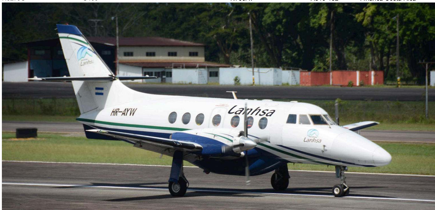
Lanhsa (Línea Aérea Nacional de Honduras S.A.), is an airline in Honduras operating scheduled and charter service, using the venerable BAe3100 on its routes. Pictured here is BAe3201 HR-AYW, which resided for most of its life in North America (first in the US, then Canada) before moving to sunnier locations in Latin America, per September 2017.