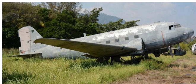
Stored on the old runway, 106 is one of several C-47s slowly fading away at Ilopango. (19 February 2019)