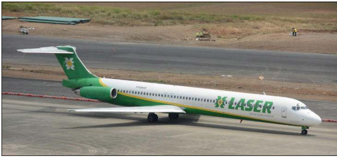
Previously with American Airlines MD-80 YV2945 was added to the LASER fleet in late 2013.