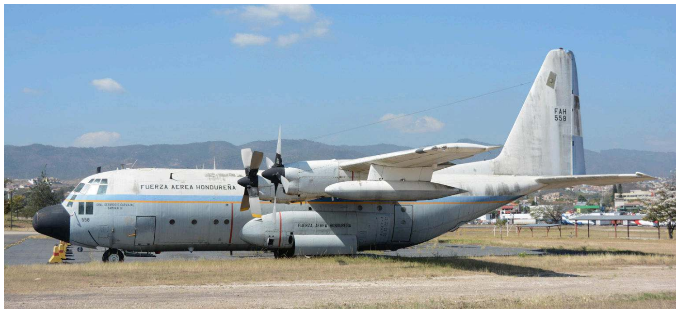
Honduras C-130A Hercules is stored at Tegucigalpa-Toncontin since at least October 1986. (21 February 2019)