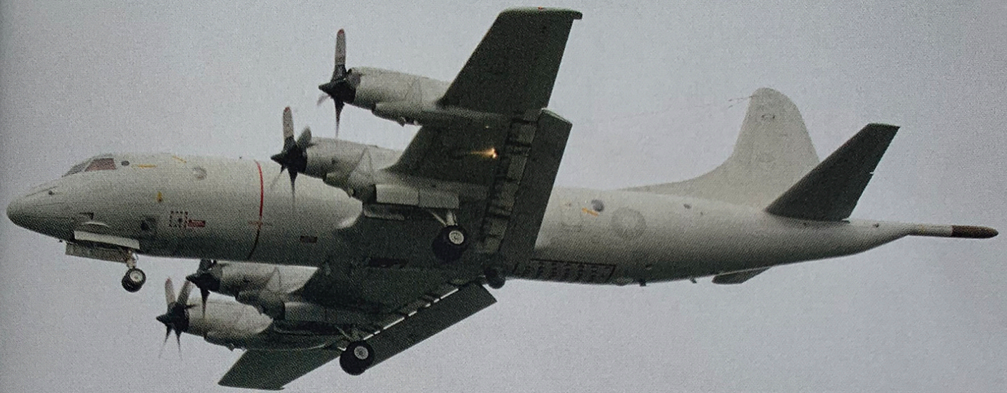
Orion rules this month. Raymond van Dijkhuizen joined a tour through a few Asian countries as can be seen in the Triptease section. Having seen three countries flying the P-3 in one trip deserves this special, starting with Taiwan, which only recently started operating this aircraft type. P-3C 3310 of 34sq (Pingtung South, 5 December 2019, Raymond van Dijkhuizen)